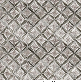
PIETRO Ficelle 09