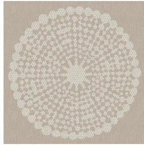
ANGELE Sable 67