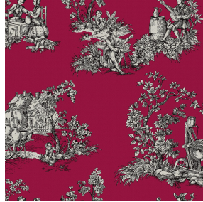
ZELIE Rubis 59 Print pattern