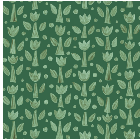
TULIPE Lierre 124 Print pattern