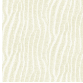
SABLE Ivoire 115 Print pattern