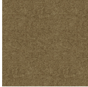
ELAINA Chamois 111 Print pattern