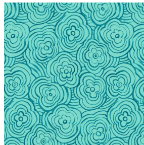
ONDES Turquoise 53