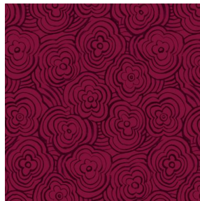
ONDES Opéra 104