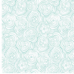
ONDES glacier 43 Print pattern