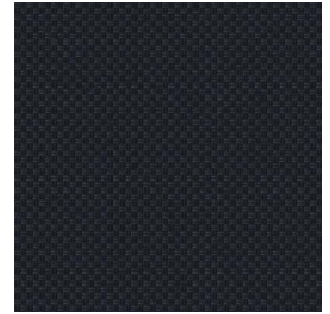
CHARLOTTE Noir 10