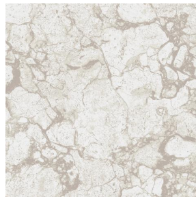
CARRARA Lin 11