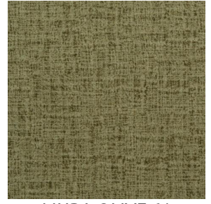
MURA OLIVE 61