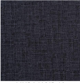
MURA NOIR 10