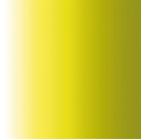
ZENITH Anis 62 Print pattern