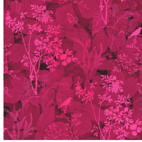
ODE Fuchsia 33 Print pattern