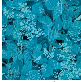
ODE Turquoise 53