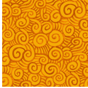
TUMULTE Safran 49 Print pattern