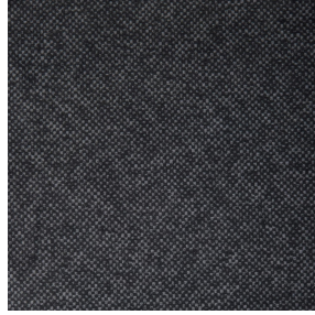
ANATOLE Titanium 98 Print pattern