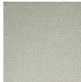
MUNA Coco 142