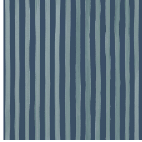
SONG Titanium 98 Print pattern