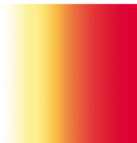
ZENITH Agrume 69