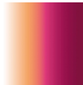
ZENITH Pivoine 57