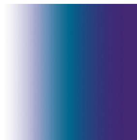
ZENITH Bleu 41