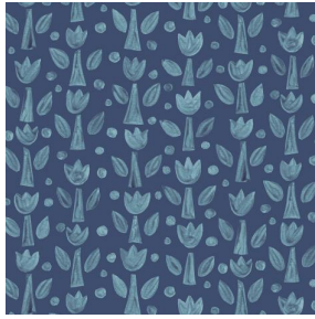
TULIPE Indigo 119