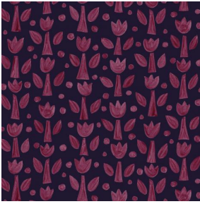
TULIPE Bordeaux 04