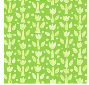
TULIPE Anis 62