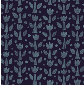
TULIPE Nuit 128