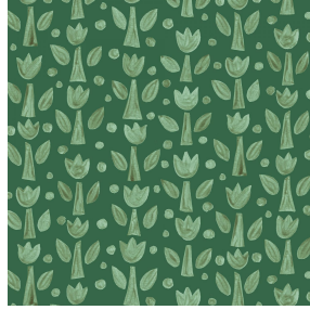
TULIPE Lierre 124 Print pattern