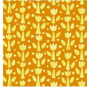
TULIPE Soleil 127