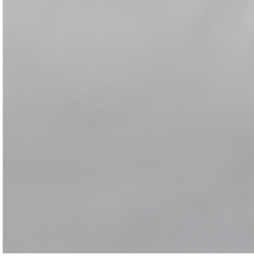
BELORA BPI 00 Printing support