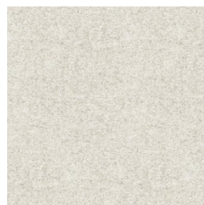
ELAINA Ivoire 115