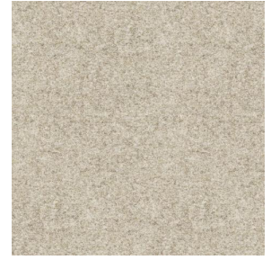
ELAINA Lin 11