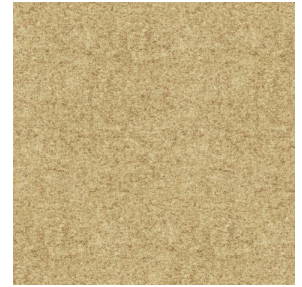
ELAINA Beige 63