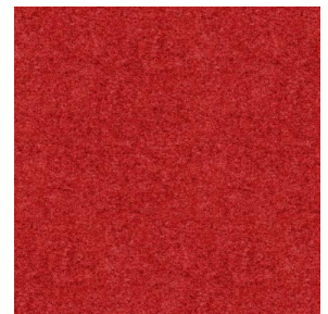
ELAINA Rouge 21