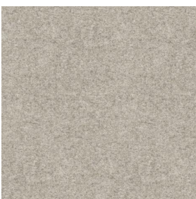
ELAINA Naturel 26