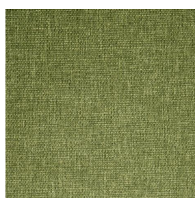
MUNA Olive 61