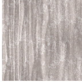
6027 Taupe 95 Print pattern