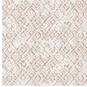
6038 Beige 63 Print pattern