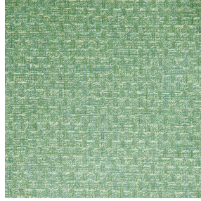
RUSTIC Prairie 125 Print pattern