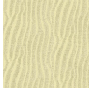
SABLE Sable 67