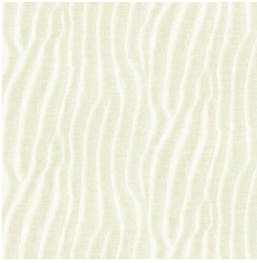
SABLE Ivoire 115