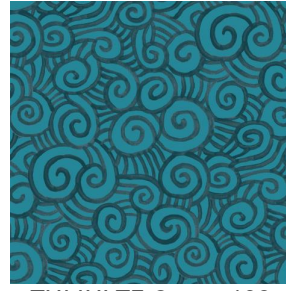
TUMULTE Orage 123