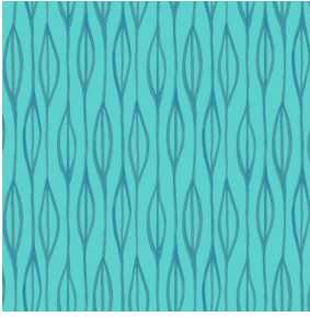
YENDI Lagon 110