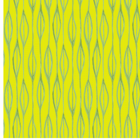
YENDI Anis 62 Print pattern