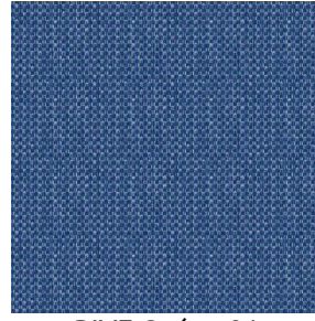
RIVE Océan 91