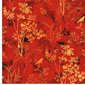
ODE Corail 14 Print pattern