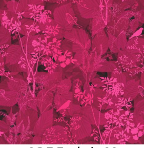
ODE Fuchsia 33