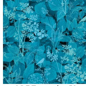
ODE Turquoise 53