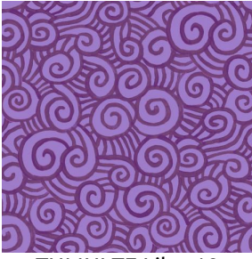
TUMULTE Lilas 19