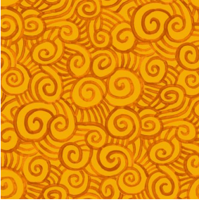
TUMULTE Safran 49