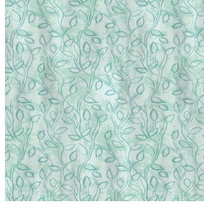
6053 Céladon 135 Print pattern