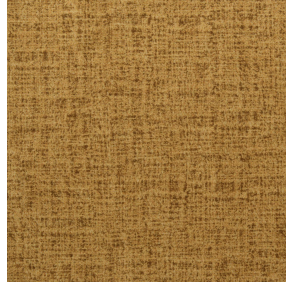
MURA SAVANE 185 Print pattern