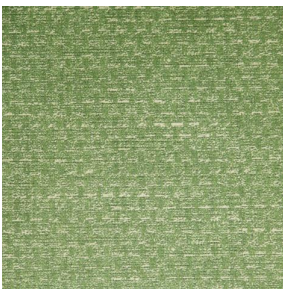
RUSTIC Mousse 92