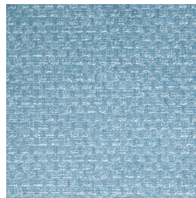
RUSTIC Glacier 43