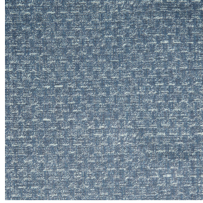
RUSTIC Bleu 41 Print pattern