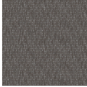
FLOT Taupe 95 Print pattern