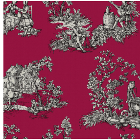
ZELIE Rubis 59 Print pattern