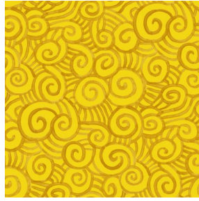
TUMULTE Maïs 37