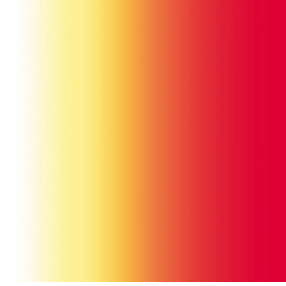
ZENITH Agrume 69 Print pattern