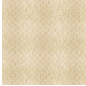
CALI Naturel 26 Print pattern