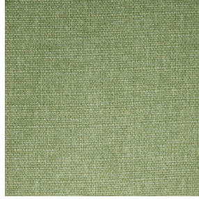
MUNA Tilleul 103 Print pattern