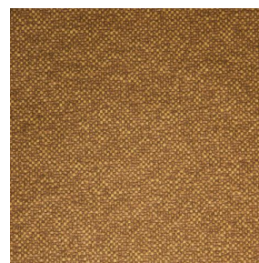
ANATOLE Or 94