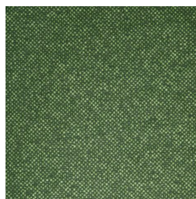
ANATOLE mousse 92