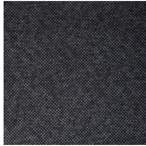
ANATOLE Titanium 98 Print pattern