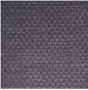
RUSTIC Titanium 98