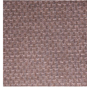
RUSTIC Terre 107