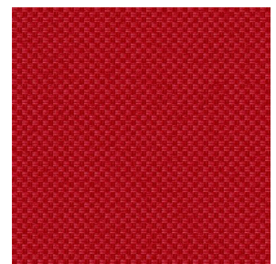
CHARLOTTE Fiesta 131