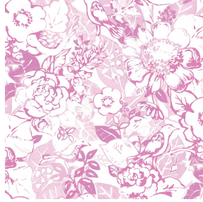
CHARMETTE rose 129 Print pattern