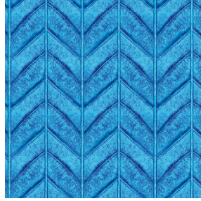
NERVURE Bleu 41 Print pattern