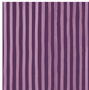
SONG Prune 84