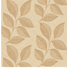
PETIPOIS Naturel 26 Print pattern