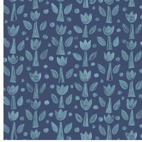
TULIPE Indigo 119 Print pattern