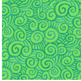
TUMULTE Prairie 125 Print pattern