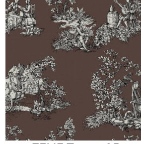
ZELIE Taupe 95