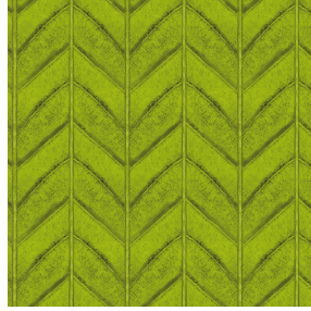
NERVURE Mousse 92 Print pattern